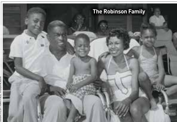
The Robinson Family

“Jackie Robinson was a sit-inner before sit-ins, a freedom rider before freedom rides.” — Martin Luther King Jr.