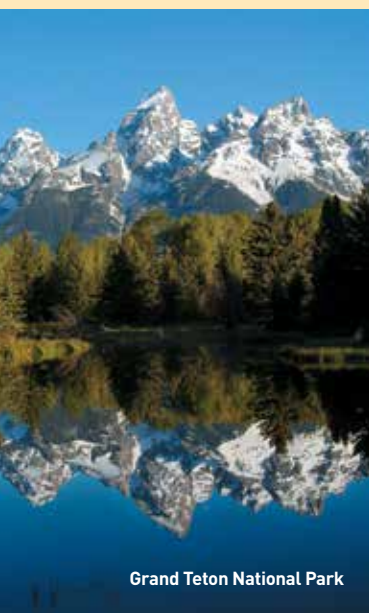
Grand Teton National Park

During the last week of April, WETA marks the upcoming National Parks Service centennial with a presentation of the 2009 Ken Burns collaboration The National Parks: America's Best Idea , a six-part exploration of the history of one of America's important legacies to future generations. Filmed at some of the nation's most spectacular locales — from Acadia to Yosemite, Yellowstone to the Grand Canyon, the Everglades of Florida to the Gates of the Arctic in Alaska — the documentary is a visual feast. The National Parks traces the birth of the park idea in the mid-1800s and follows its evolution for 150 years, highlighting iconic places amid the American landscape, while relating the stories of people from every conceivable background who devoted themselves to saving and preserving lands they loved.