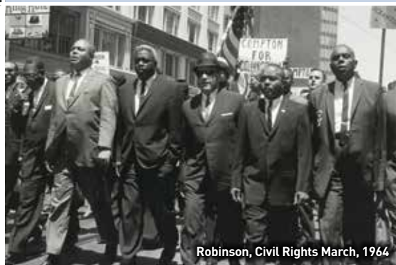
Robinson, Civil Rights March, 1964