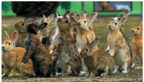
ROD CLARKE/BB JOHN DOWNER PRODUCTIONS

9:00 NOVA: SINKHOLES—BURIED ALIVE — A growing worldwide hazard that lurks wherever limestone and other water-soluble rocks underpin the soil, sinkholes can occur gradually when the surface subsides into depressions, or suddenly, when the ground gives way. NOVA travels the globe to investigate sinkholes. {DVI} Repeats Thur 10/22, 5pm