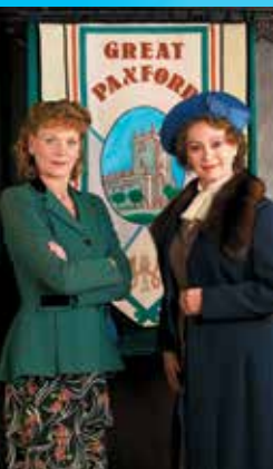
CITY STUDIOS FOR MASTERPIECE